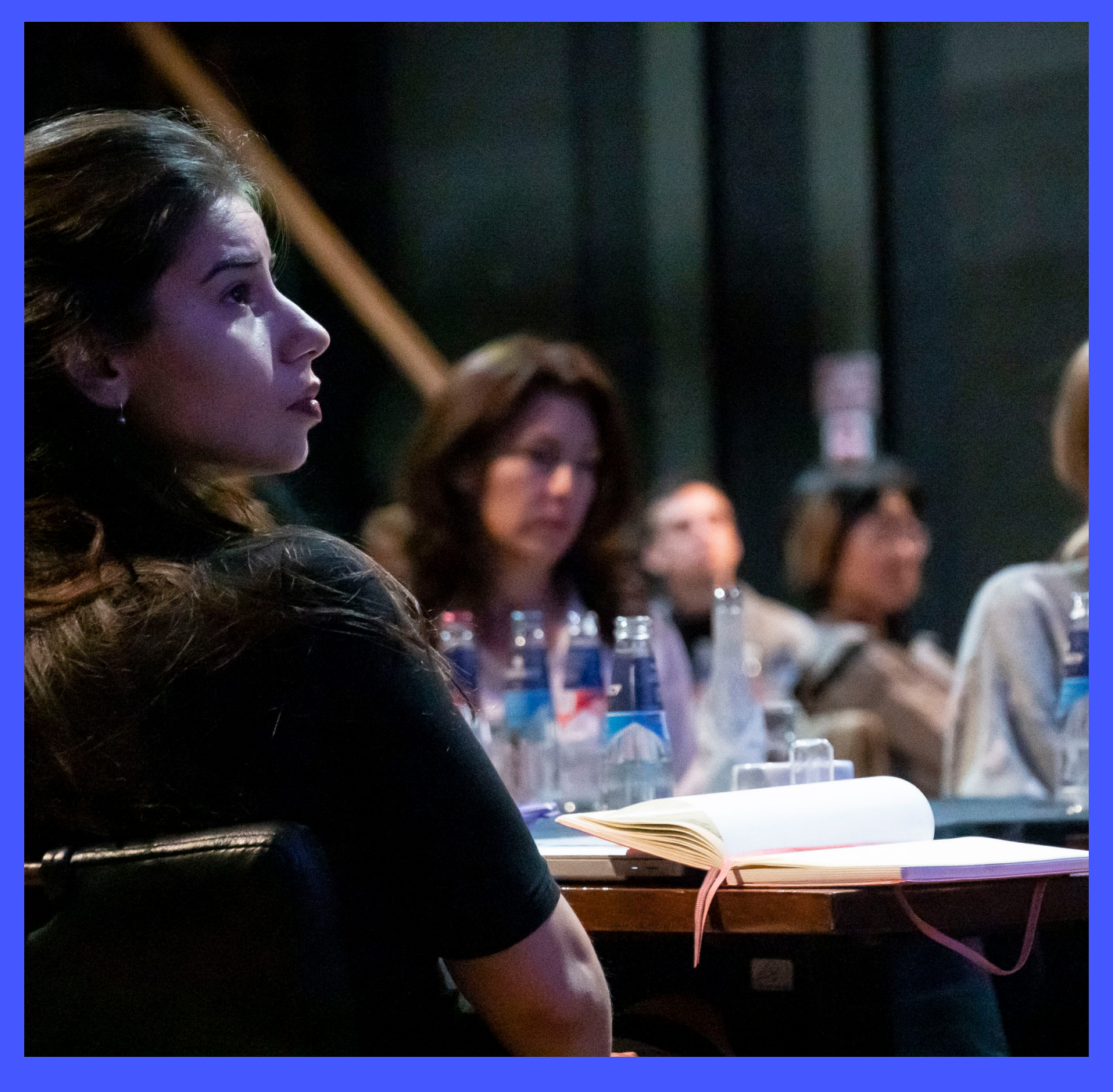
Participants at Fair 2020.