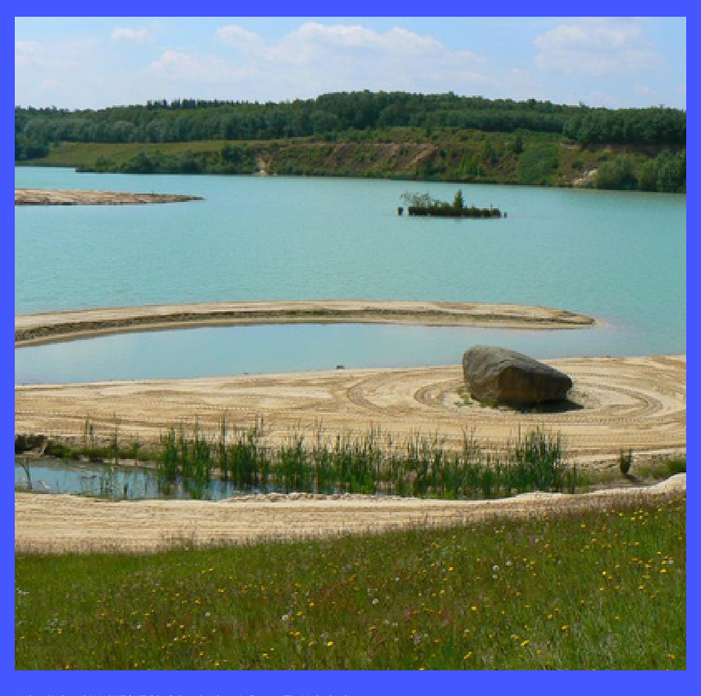
Broken Circle and Spiral Hill (1971) by Robert Smithson in Emmen, The Netherlands.