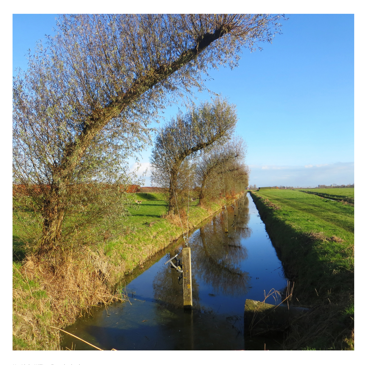
No title by William Forsythe, landmark in Groningen, The Netherlands.