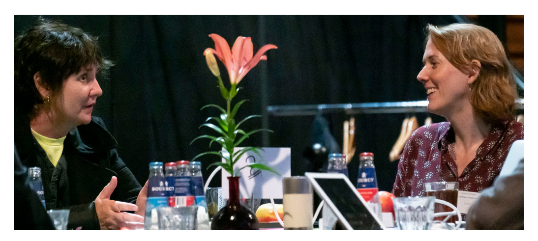
Participants of Fair 2020 having a discussion.

In the wake of the publication, DutchCulture set out to explore both the possibilities and the challenges of fair international cultural cooperation through the above-mentioned series of gatherings. These meetings provide a platform to strengthen each other's knowledge and identify ways that participants can translate into actions, cultural policies and long-term international collaborations. The goal is to formulate a mutually constructed code of conduct which can be adopted by cultural practitioners around the world.