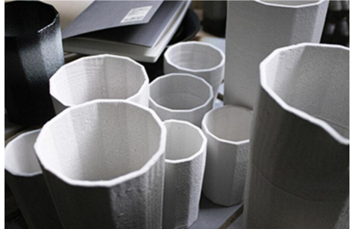
Benedetta Pompili, Once-Fired Blue (Arita)