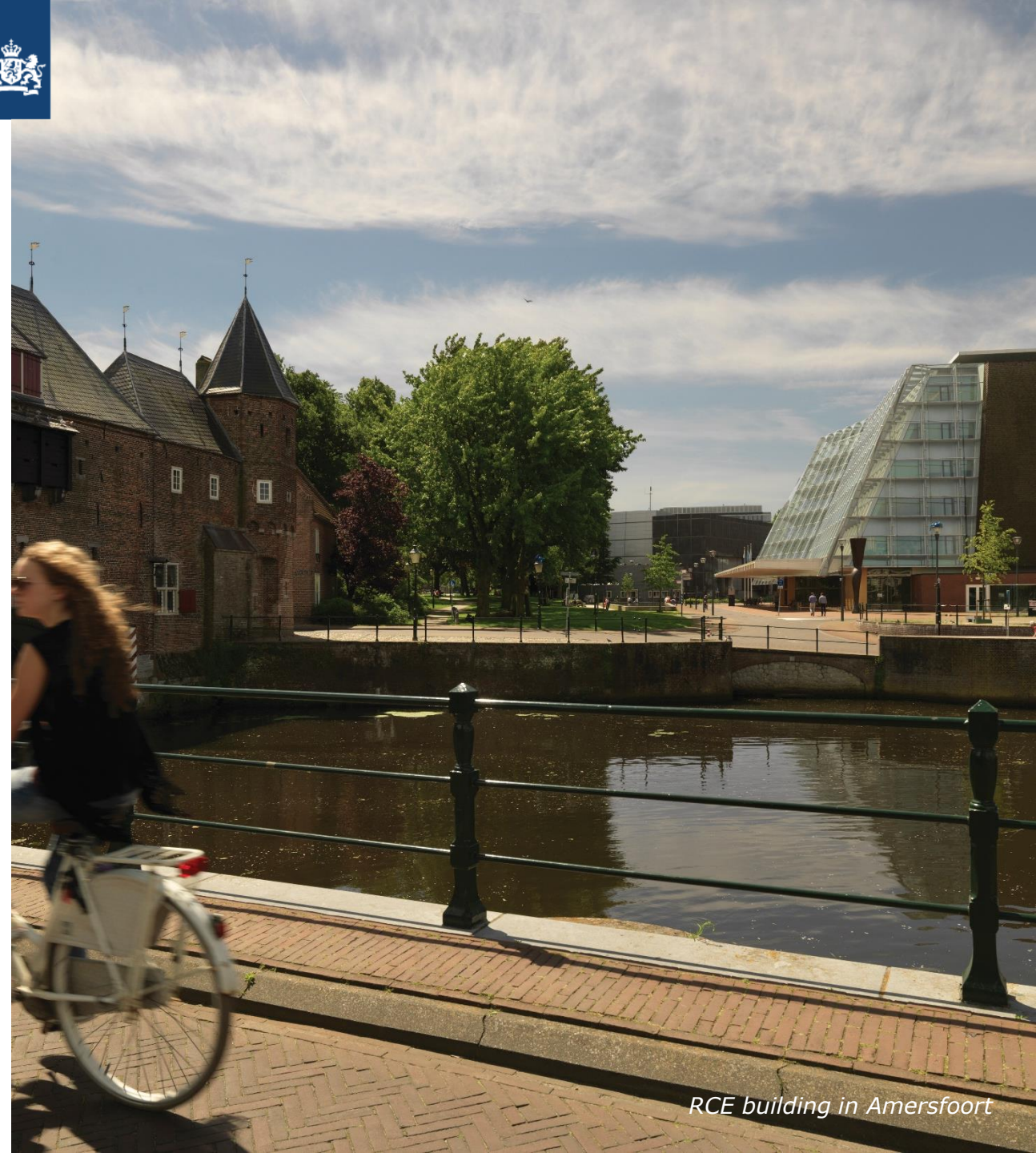
RCE building in Amersfoort