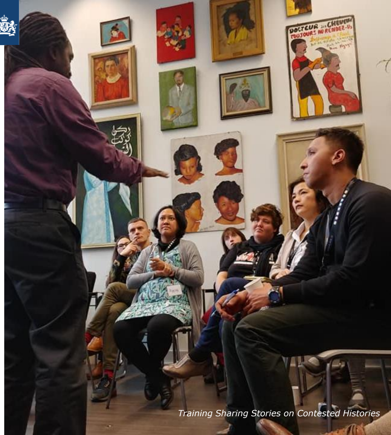
Training Sharing Stories on Contested Histories