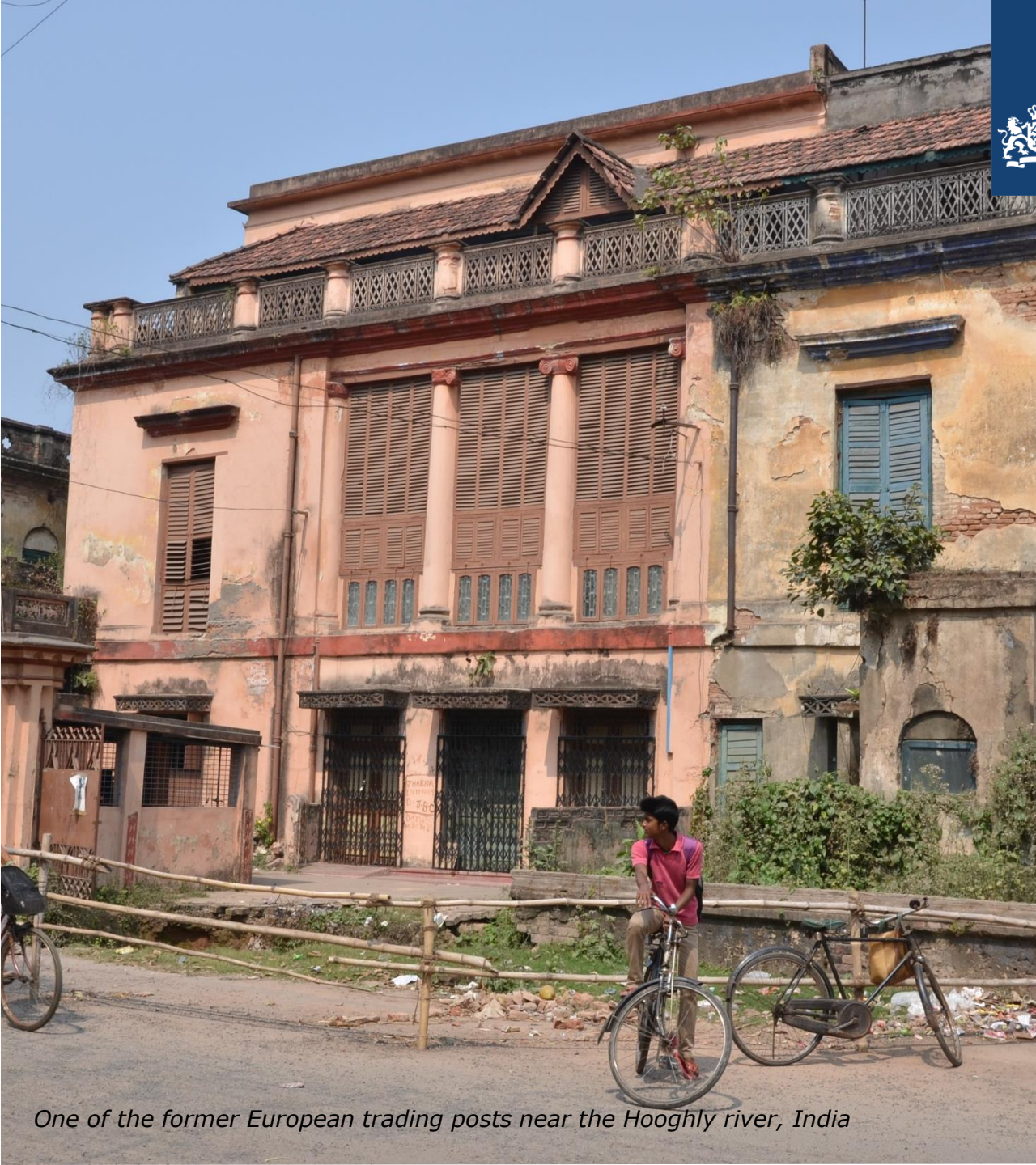
One of the former European trading posts near the Hooghly river, India

From shared heritage to shared challenges